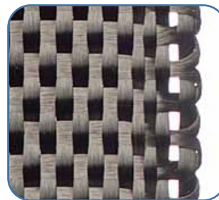
Finished Edge Closeup

Fabtech Ultra-lite™ carbon tapes are custom made to our exact specifications, and specifically designed for use when additional reinforcement layers are needed in prosthetic and orthotic device designs and the thinnest build up in layers is required. This material specification when combined with RESTECH+ Advanced Epoxy yields an incredibly strong device.