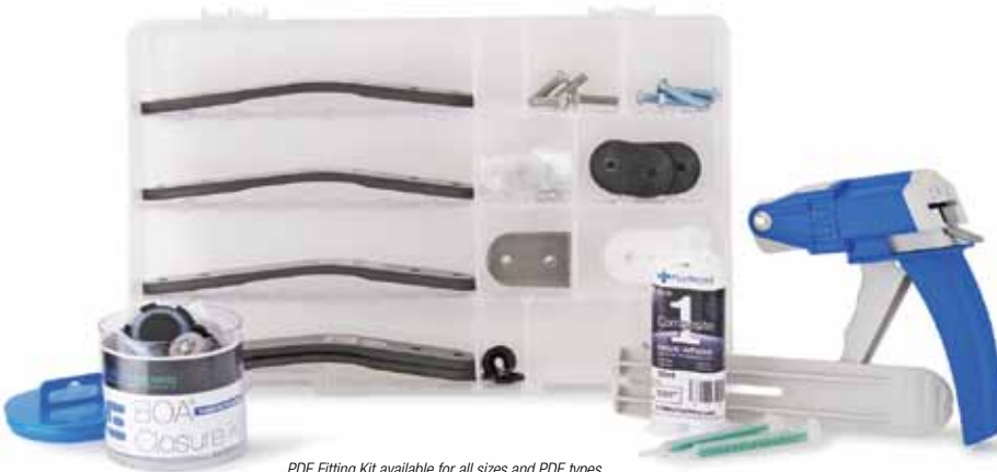
PDE Fitting Kit available for all sizes and PDE types.